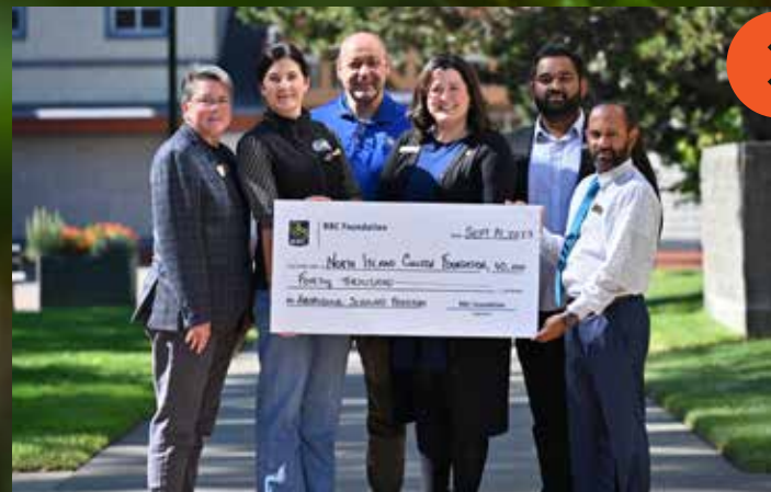
NIC and RBC representatives meet at the Comox Valley campus

A partnership with the RBC Foundation has helped us spread the seeds of possibility for many Indigenous students at NIC.